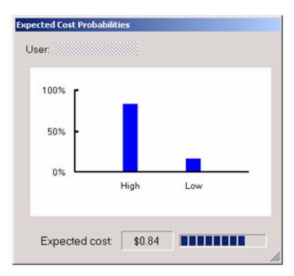
Figure 3. Real-time inference with BusyBody models showing probability distribution and expected cost of interruption for a user.

In interviews following the training period, participants reported that they found the intermittent probes of BusyBody's assessment palette somewhat annoying but they appeared to maintain a friendly attitude toward the inquisitive system that had been curiously nosing its way onto their desktops during training.