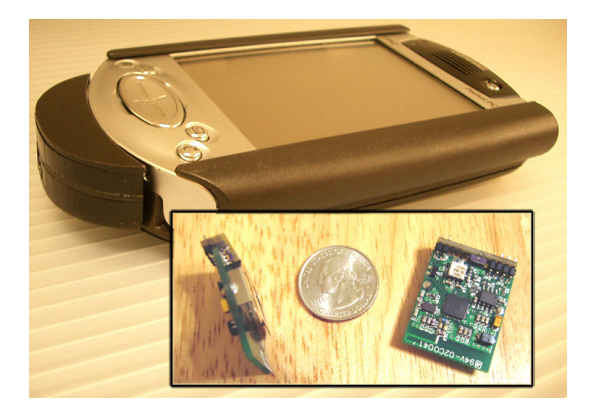
Figure 4: The 3-axis wireless accelerometers (with a U.S. quarter) and the iPAQ with the receiver casing.

Subjects were asked to carry the iPAQ with them at all times, either in a small pouch that attached to a belt or in a small travel bag that was provided by the researchers.